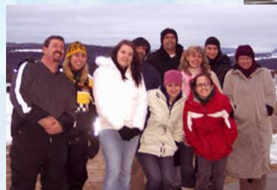
Taking a break for a sleigh ride during a Parent Seminar.